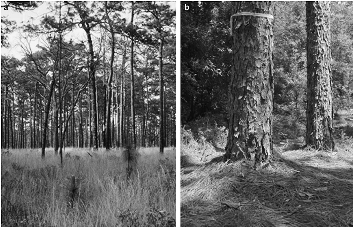
Figure 1. (a) A frequently burned Longleaf pine ecosystem reference condition at Eglin Air Force Base, Florida. Pristine pinelands are rare in current landscapes of the southeastern United States. (b) A typical long-unburned (37 years since fire) Longleaf pine forest at the Ordway-Swisher Preserve, Florida. Many pinelands throughout the southeastern United States have undergone decades of fire suppression, leading to increases in the midstory, organic forest floor soil horizons, and decreases in plant and animal species richness.

Without fire in Longleaf pine ecosystems, understory communities undergo radical shifts in cover and richness. Frequently burned pineland understory communities are among the most species-rich outside of the tropics (Peet &