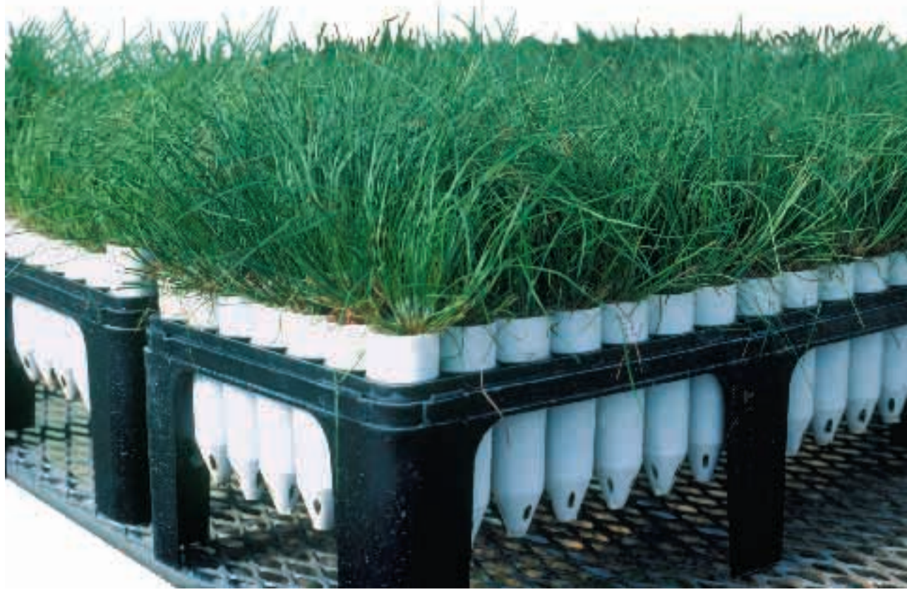
Vigorous seedlings with good needle color and length and in an appropriate size container.

The presence of mycorrhizae indicates a healthy root system. Inoculation of seedlings with mycorrhizal spores is