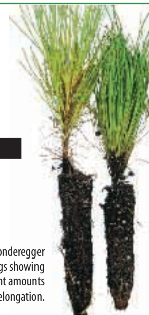
Sonderegger seedlings showing different amounts of stem elongation.