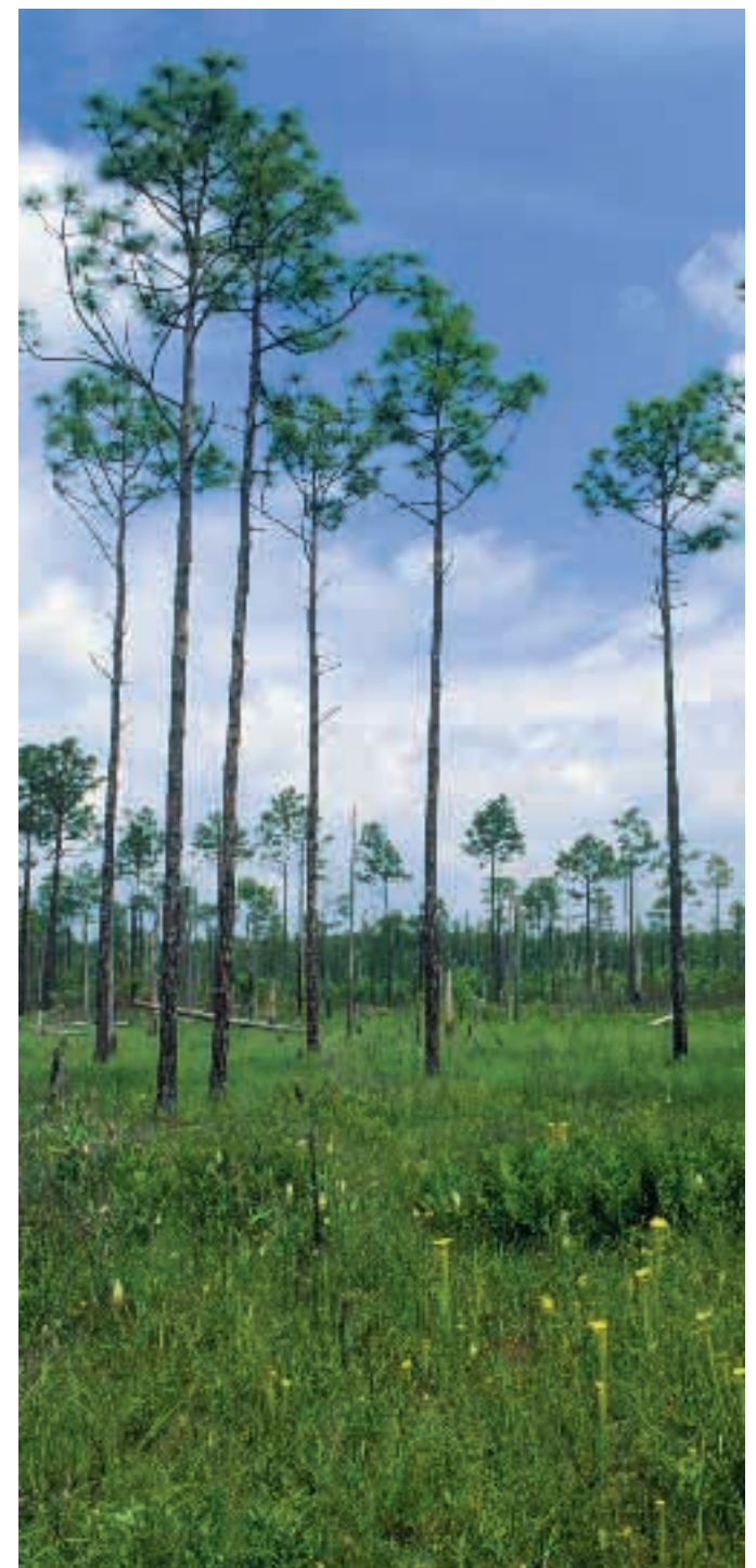
Pole size longleaf pine .