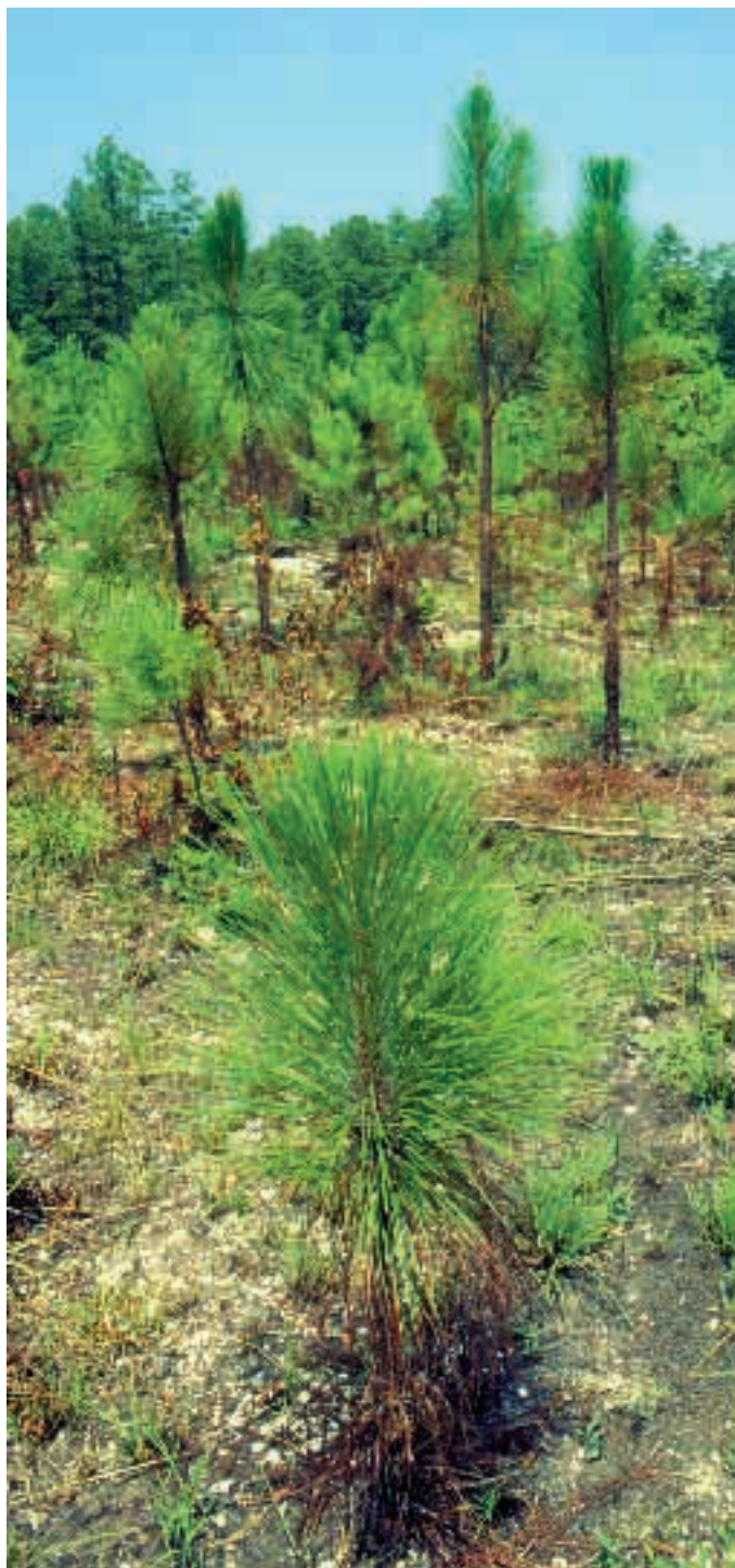
Young longleaf seedlings recently burned.