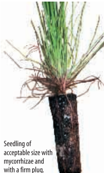
Seedling of acceptable size with mycorrhizae and with a firm plug.

The presence of needle fascicles indicates a well-developed seedling. If needles do not develop in clusters of two or three, the seedlings will perform well when planted. Generally, needles should be pale to dark green in color. Seedlings grown in northern nurseries may have variations in color that result from exposure to cold temperatures. Yellowish needles indicate poor seedling vigor.