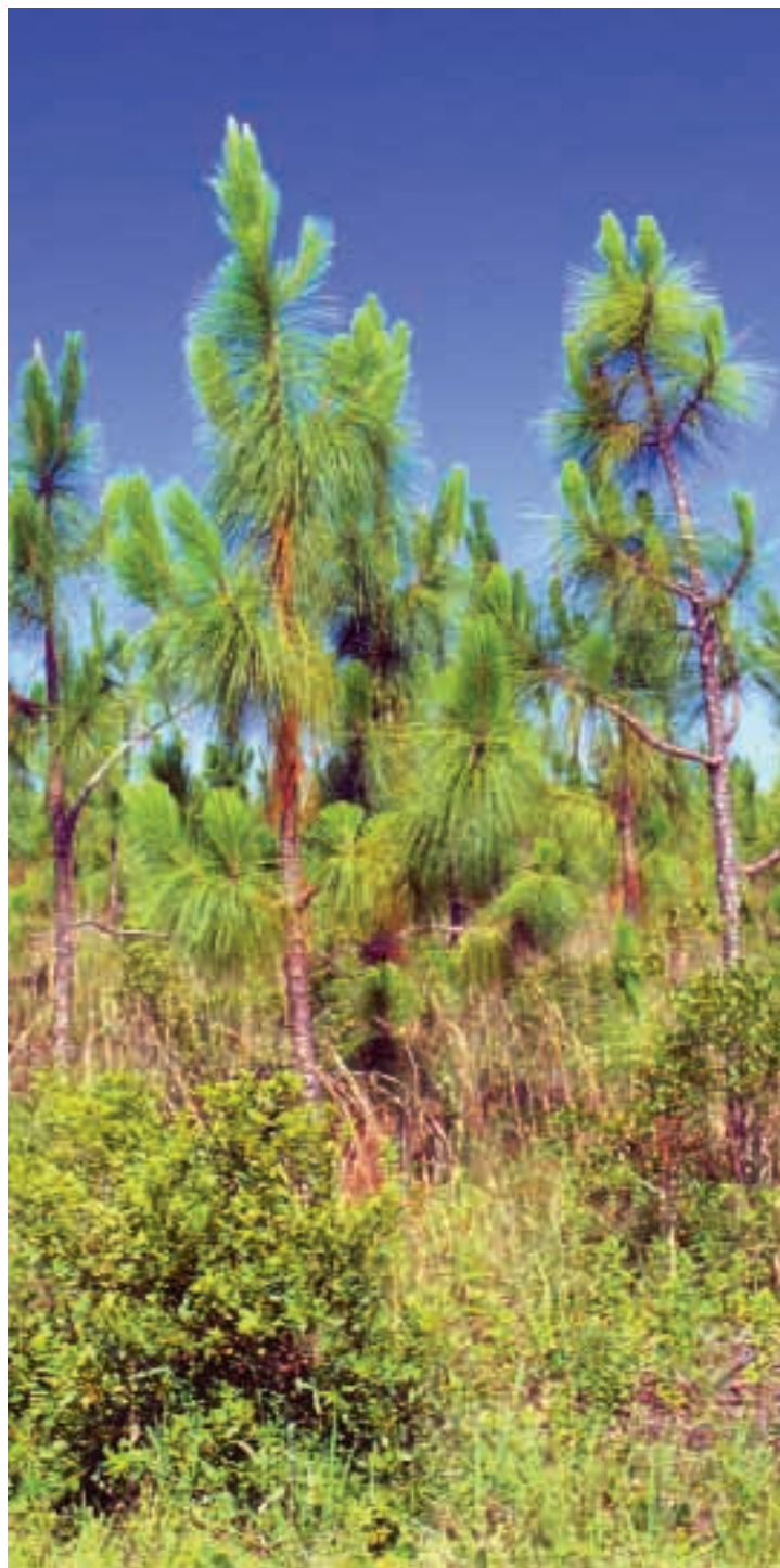
Longleaf saplings into rapid height growth.