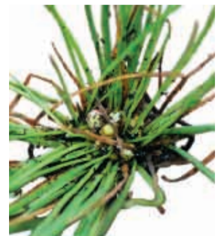
Visible buds at the base of the needle cluster.

always be moist. Third, no competing weed or insect problems should be evident. Seedlings with any such problems should be culled during extracting and packing.