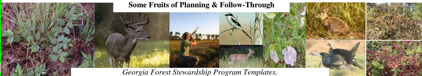
Georgia Forest Stewardship Program Templates.