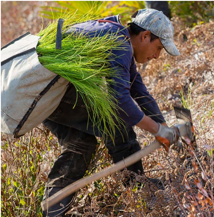
Longleaf seedling planting on Sansavilla tract

A LRI estimates that roughly 131,250 acres of longleaf pine were planted in 2017, a six percent decrease from 2016. This continues a concerning five-year trend of planting declines. Encouragingly, however, planted acreage on private lands increased to 111,845 acres, a two percent improvement compared to 2016. Planted acreage on public lands decreased by 35% to 19,409 acres, accounting for the entire overall decline in longleaf establishment.