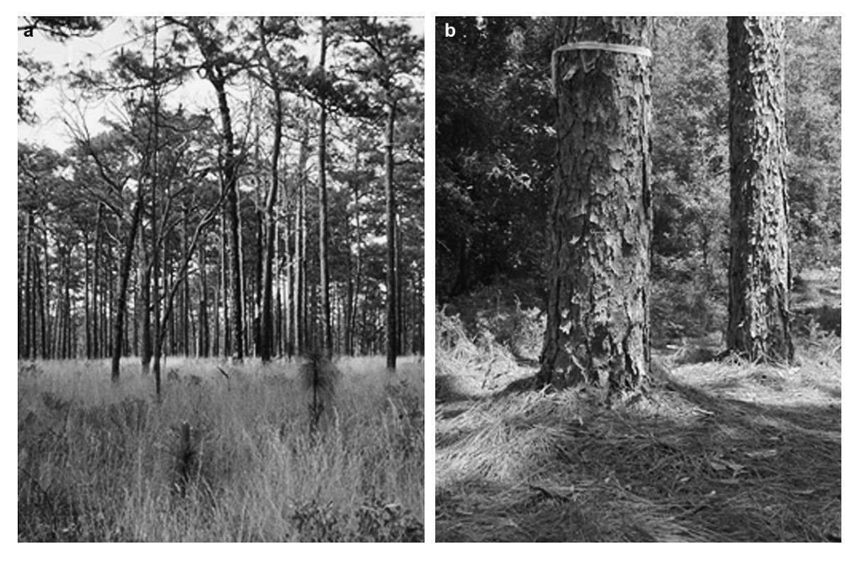
Figure 1. (a) A frequently burned Longleaf pine ecosystem reference condition at Eglin Air Force Base, Florida. Pristine pinelands are rare in current landscapes of the southeastern United States. (b) A typical long-unburned (37 years since fire) Longleaf pine forest at the Ordway-Swisher Preserve, Florida. Many pinelands throughout the southeastern United States have undergone decades of fire suppression, leading to increases in the midstory, organic forest floor soil horizons, and decreases in plant and animal species richness.

Without fire in Longleaf pine ecosystems, understory communities undergo radical shifts in cover and richness. Frequently burned pineland understory communities are among the most species-rich outside of the tropics (Peet &